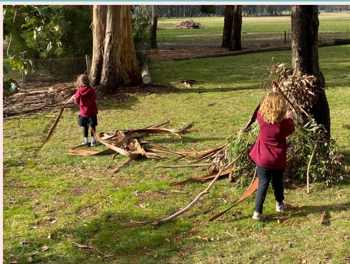
Cubby building on the oval.

We gained a new family for 2021 and have a robust enrolment of eight in 2021 and the same in 2022 unless we get a new enrolment or two. We are looking forward to a big influx of preps in 2023. Students of all year levels are welcome but we are always keen to have preps start with us every year.