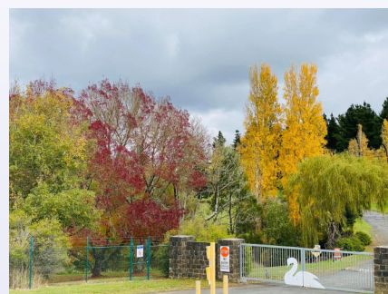
Entrance to the White Swan Reservoir.

FREE excursions (Halls Gap Zoo this term and our 10 week gym/swimming program in term 3.